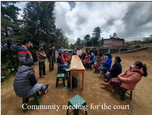
Community meeting for the court

The community adopted the name of Chocantariiy of Mayan origin (Q'eb'al), which means jar because there was a jar that the villagers found there. At first, there were only two families that lived in the community, the Xiloj family and the Velásquez family. Over time, it gradually became populated, and as a result, the population has grown significantly. The current population is 500 inhabitants, with 388 of them being children. The community of Chocantariiy is a part of the rural settlement of Los Cipreses, whose precise date of founding is unknown. However, the Village of Los Cipreses has historically been a clear example of organization. Since its creation, the people of the community always wanted to improve themselves, and they did this through the formation of the community association COCODE.